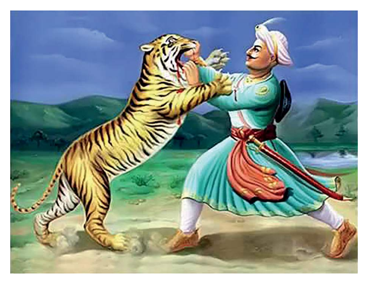
An image portraying a legend about Tipu Sultan, ruler of Mysore (artist unknown)

Permission to reproduce items where third-party owned material protected by copyright is included has been sought and cleared where possible. Every reasonable effort has been made by the publisher (UCLES) to trace copyright holders, but if any items requiring clearance have unwittingly been included, the publisher will be pleased to make amends at the earliest possible opportunity.